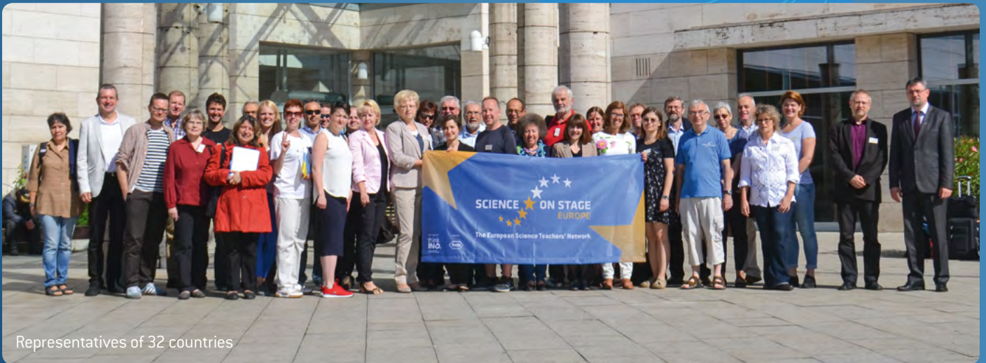
Representatives of 32 countries