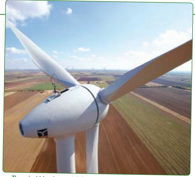
The wind blowing up high is stronger than the wind blowing near the earth's surface.

turbine. It is located in the nacelle (machine pod), at the foot of the turbine, or outside the tower. For example, wind measuring devices on the wind turbine send data about the current wind strength and wind direction to the control computer. The control computer then sends information to the yaw motors, which turn the entire nacelle so that the rotors are facing into the wind. The straighter the wind turbine is facing into the wind, the more electricity it produces.