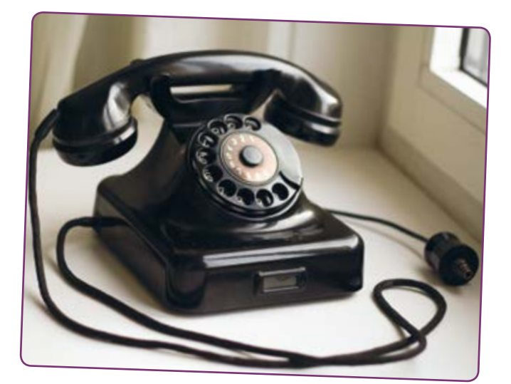
This model W48 telephone was the standard telephone of the German Post Office from 1948 until about 1970. What do you notice about it?