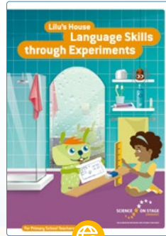
Language Skills through Experiments