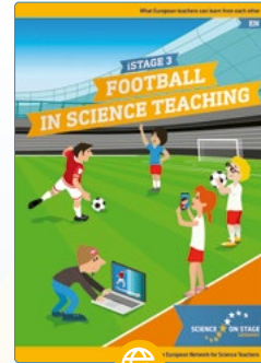
Football in Science Teaching