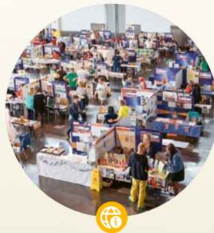
Science on Stage festivals